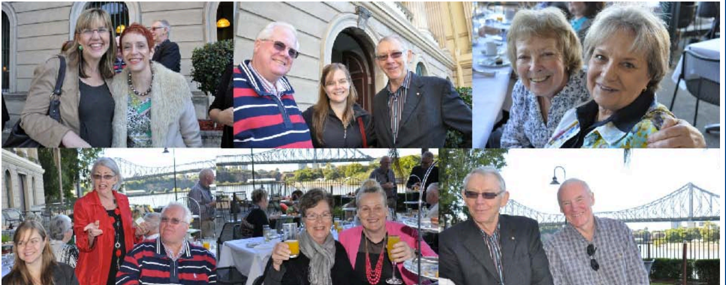
A few in this shot with their eyes closed – we suspect too many sweets ...(chocolate!)