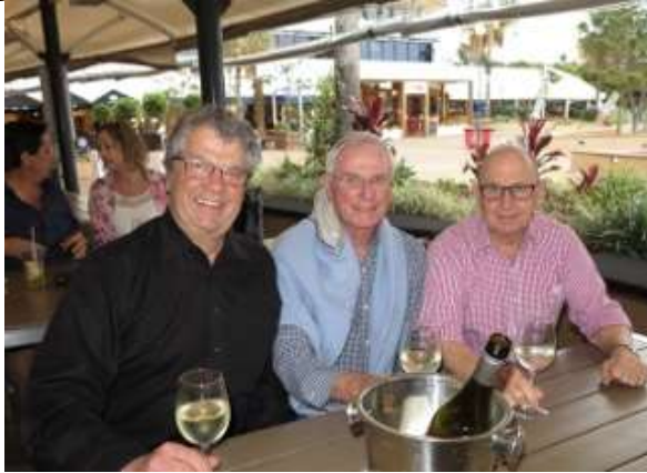
Post concert debriefing