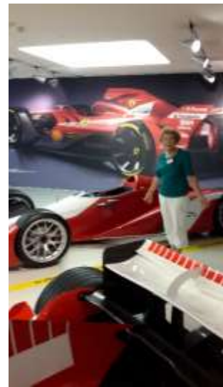
Toughing it out in Parma and the Ferrari museum