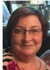
Susan Rix Foundation