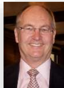
John Mills Service