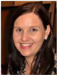
Sarah Osborne Communications