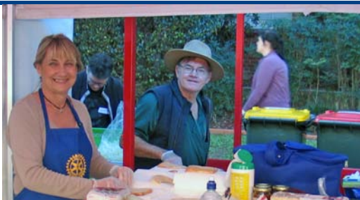
PHOTO: Dutiful Duo a Good-Looking Team... New Farm Rotary tent at the Teneriffe Festival... High-Risers get around!!!!

The Provisional Rotary Club of New Farm is fast on its way toward charter. We meet weekly on Wednesdays, alternating between morning and evening meetings each week. Please contact club