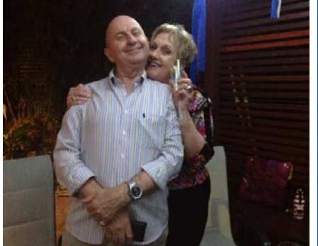
The Leveritts in China...there are now shots of the Great Wall but, how jealous do we really want to be...