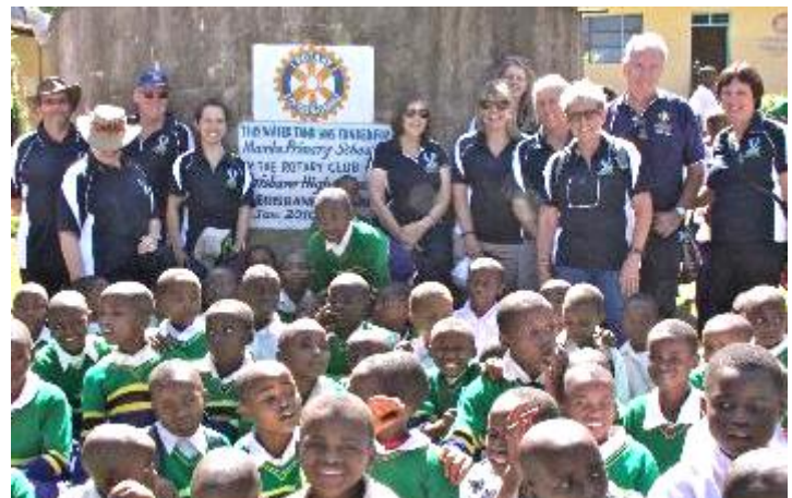
Africa Tour 2015