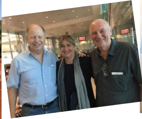
Still fresh after a long flight!