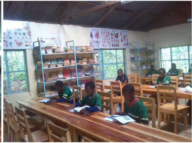
STUDENTS IN THE LIBRARY AT MAMBA PRIMARY SCHOOL