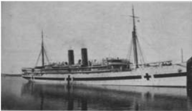
The "Maheno" as a New Zealand Hospital Ship during the Great War.

Resting peacefully on the eastern beach of Fraser Island is the TSS Maheno – during WW1 the Maheno was a hospital ship, arriving at Anzac beach on the morning of 26 August 1915 ; there the crew retrieved the wounded Australian and New Zealand soldiers.