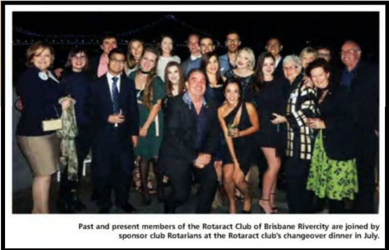
Past and present members of the Rotaract Club of Brisbane Rivercity are joined by sponsor club Rotarians at the Rotaract club's changeover dinner in July.

How good is your eye sight? Pick the High-Risers in last month's RDU magazine (left)! It would be easier if they were wearing red striped T-Shirts