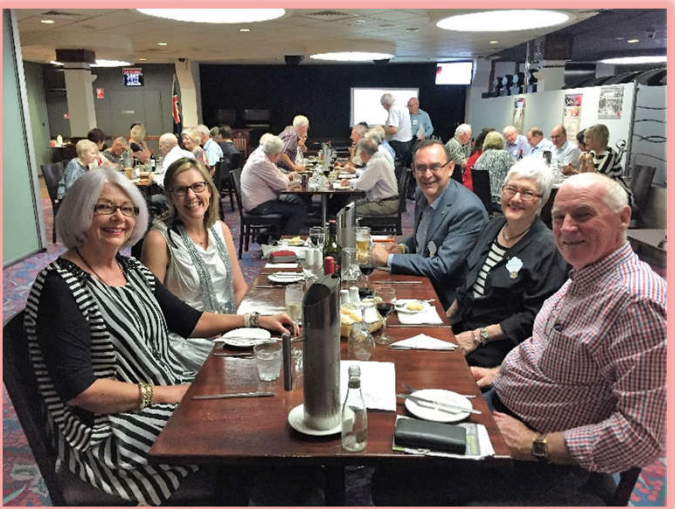
High - Rise was well represented at the Stones Corner Calcutta on Monday night. Time will tell if we have the winning tickets!