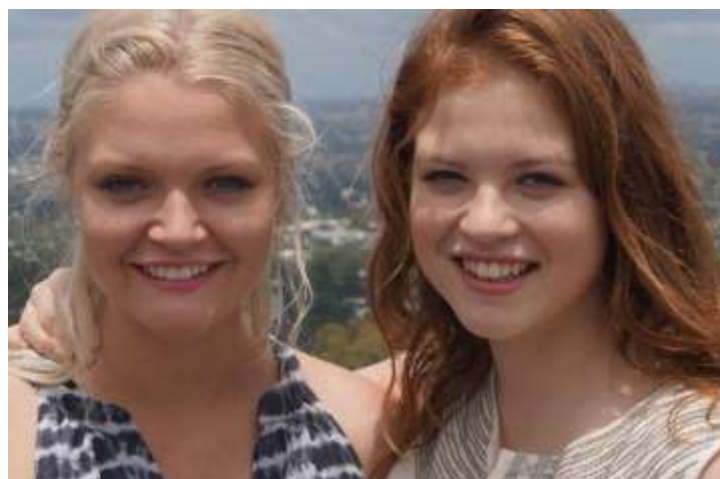
Enjoying Mt Cootha