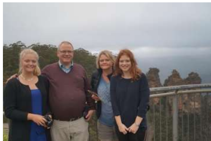
The blue mountains and the three sisters