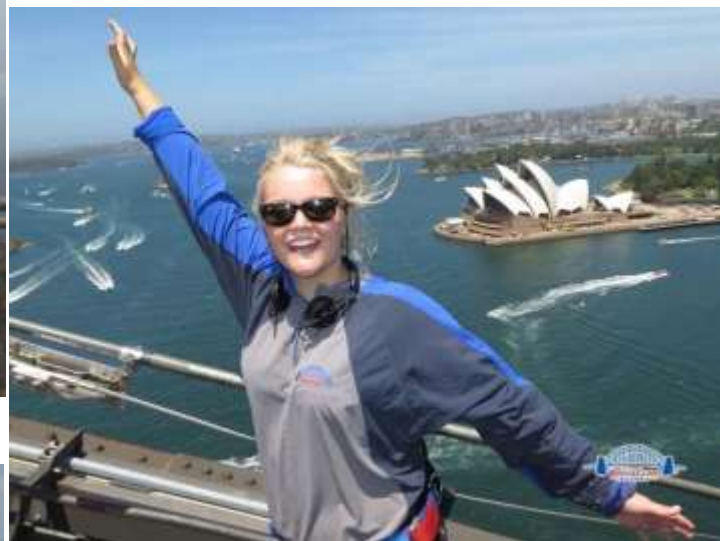
Climbing Sydney Harbour Bridge.