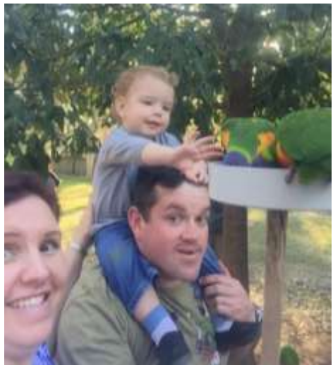
Last weekend at Lone Pine feeding harassing the locals.