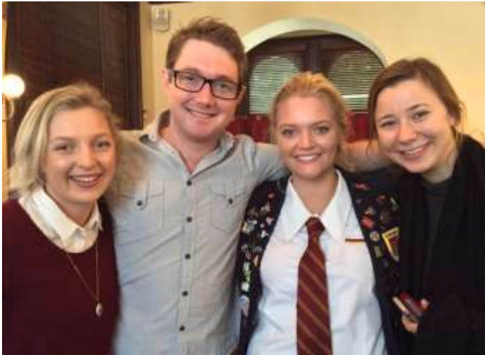
Faces of YEP