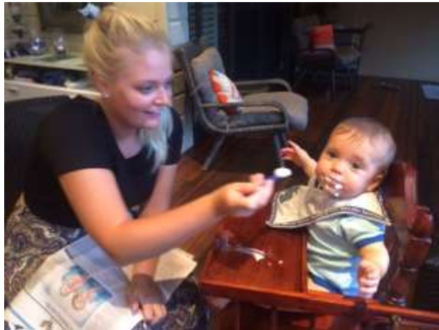
Feeding Flynn – I do believe there will now be a line up of parents and grandparents asking for assistance