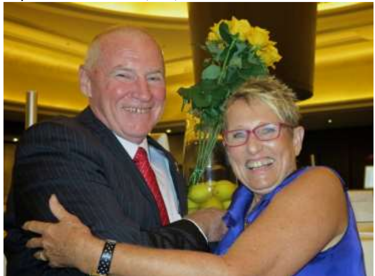
Some husbands bought the Table Centre arrangements for their wives.