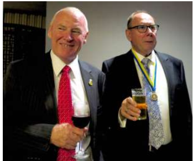
$1,000,000 Rotary Foundation Dinner actually they made closer to $2,000,000