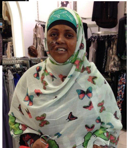
Healing well. Out shopping with no veil and looking beautiful